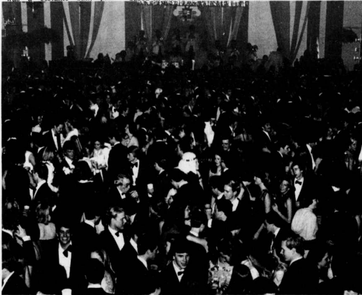
A crowded dance floor is common at Fancy Dress, but no one seems to be complaining. This year's ballroom theme is "Camelot."