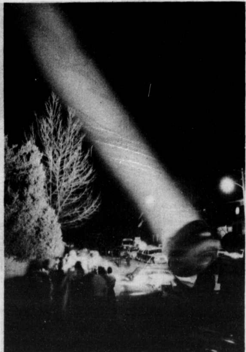
One of the two searchlights which will mark the location of this year's ball.

After disembarking, Fancy Dress goers may choose to venture down the EC hallway through an alleyway decorated with bricks, trashcans and a fire escape to recreate a scene from the Broadway smash "Westside Story." Mr. F.D.