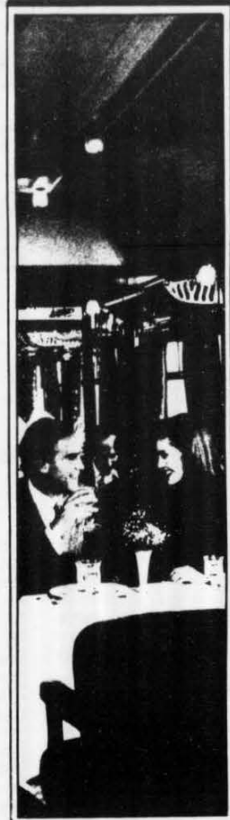
Two diners enjoy a leisure lunch aboard the Orient Express.