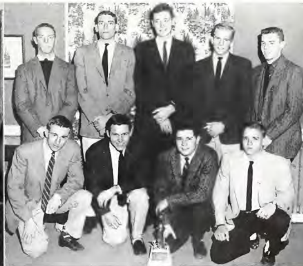
Sigma Chi Championship Swimming Team