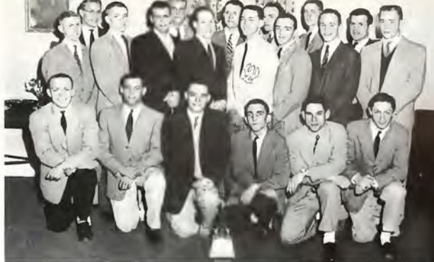
Phi Kappa Psi Championship Football Team

We add our congratulations to those who have worked to make this past year so successful with respect to participation in the spirit of true sportsmanship.