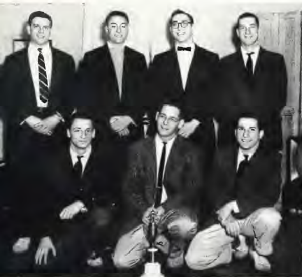
Zeta Beta Tau Championship Table Tennis Team