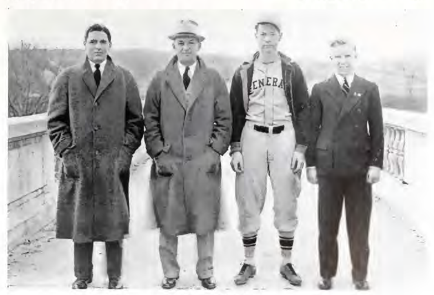
Swift, Twombly, Buck, Doane