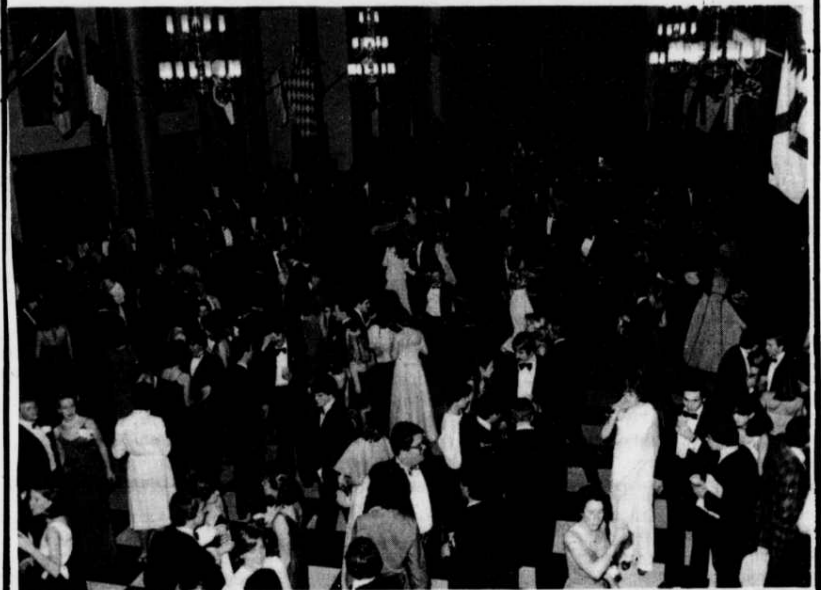
CONGRATULATIONS to the SAB for another successful Fancy Dress.