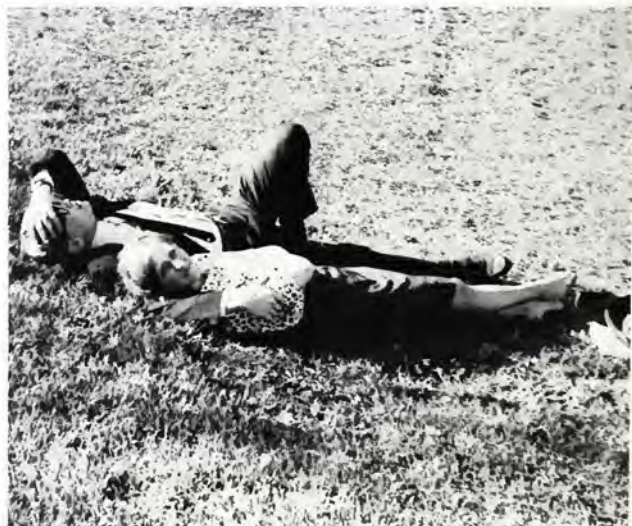
How Sweet It Is . . .