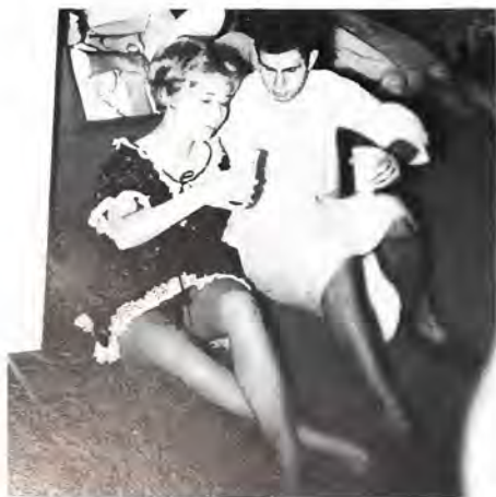
I've passed this way before.