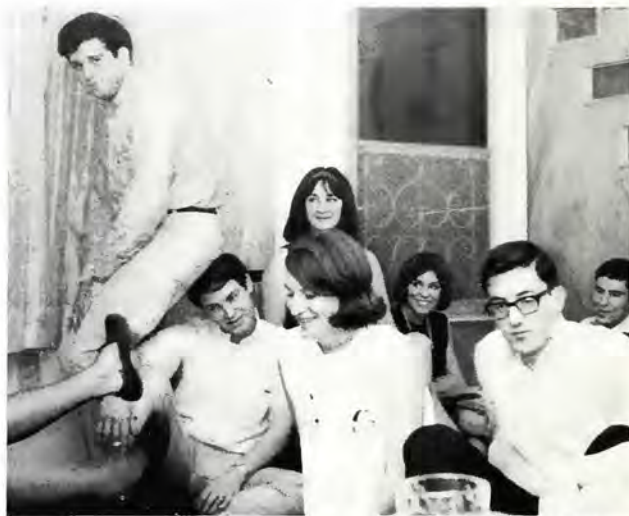
"Thanks—I needed that."