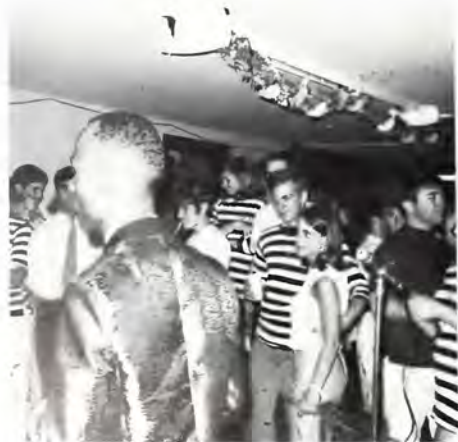
Keep your palms where they belong.