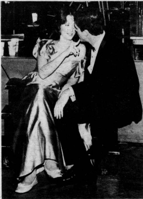
Fancy Dress Ball

A couple takes a break behind Guy Lombardo's Royal Canadians in the Main Ballroom. Approximately 1500 couples attended the Ball on Friday night.